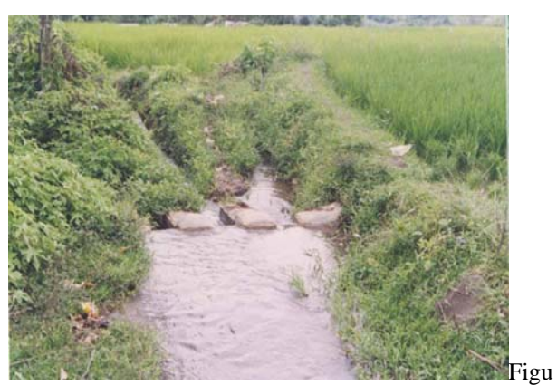
re 2. the same as figure 1 but a tool for this has been paraku made of concrete.

Figure 1. Equipment for paraku a; a part for the rice field, b; part of the map the fields below, and c; is the main channel