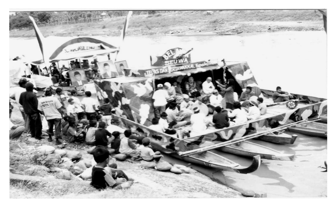
FISHING PARTY WITH EVENT MACCERA TAPPARENG, BOAT ORNAMENTAL CARNIVAL

Office : Jl. A.P.Pettarani G II No.80 Makassar - 90222 Phone : 0411 - 447 413 Fax : 0411 - 447 413